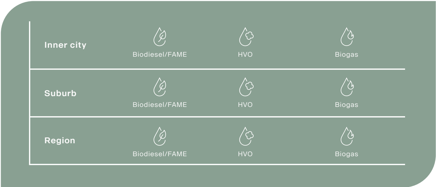
Scania's wide portfolio of low-emission vehicles.