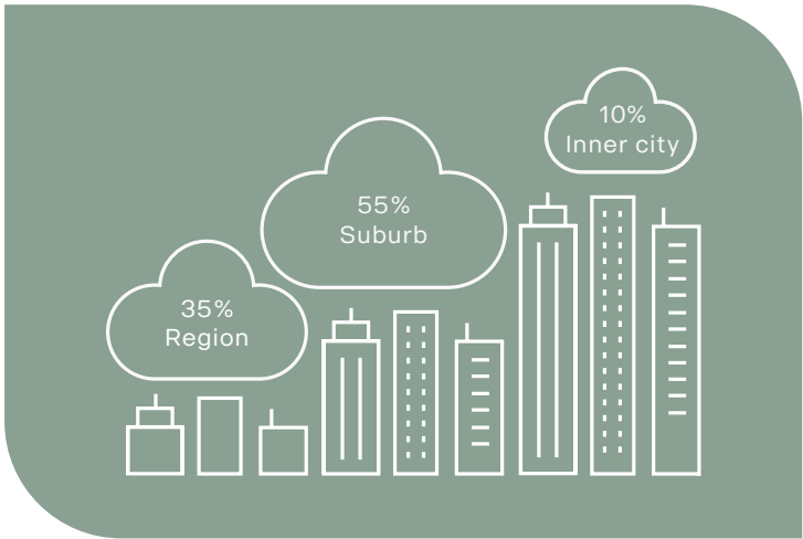
These percentages show common distribution of vehicles and CO 2 emissions in a public transport bus fleet serving a metropolitan area of more than a million inhabitants.

Scania's wide offering of renewably fuelled powertrains enables minimised environmental impact in all parts of a region - utilising the technology most suitable for the local conditions.