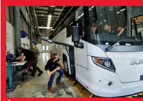
Buses as well as trucks provided real world diagnostic challenges for the seven teams drawn from across Australia

Against-the-clock fault finding and diagnosis took place on a variety of Scania products, from an industrial and marine engine to