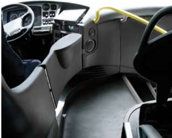
Driver's cab door