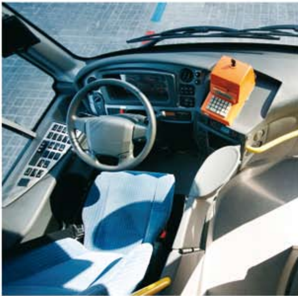
Ticket machine preparation