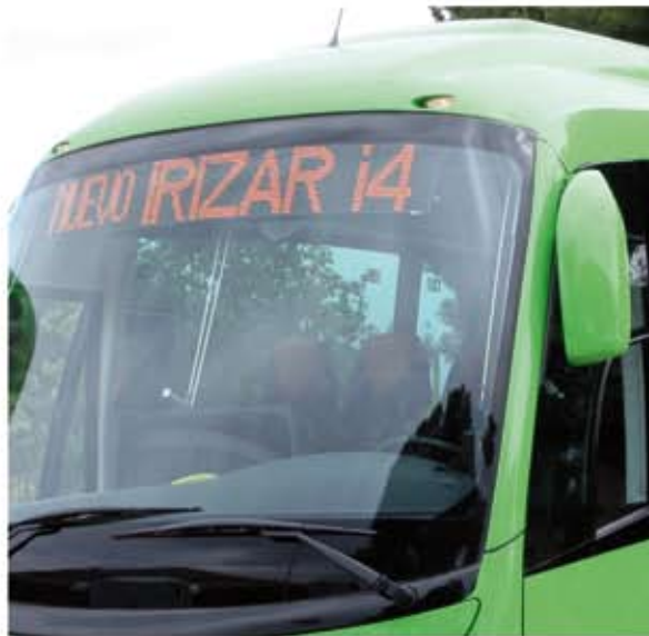
Front destination sign