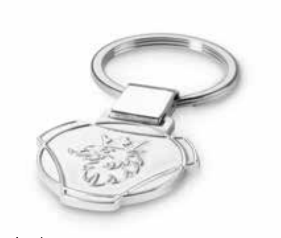
Silver key ring Solid sterling silver Scania symbol key ring. No. 1937312

Card holder from Georg Jensen with easy open/shut design. Silk matte stainless steel and rubber-coated plastic. Scania logo inside. Magnetic lock does not affect credit cards. Design by Hiromichi Konno.