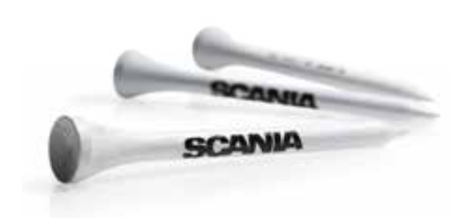
Golf tees Ten 7 cm white tees with Scania logo in black. No. 2081367