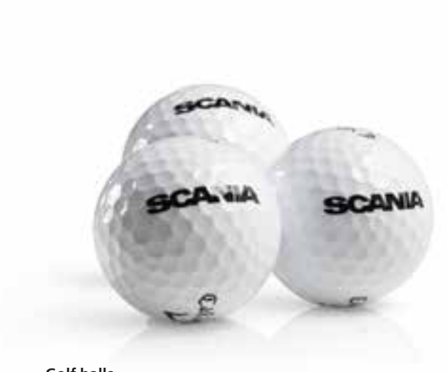
Golf balls Callaway Super Hot 3-p golf balls with black Scania logo. No. 2081366