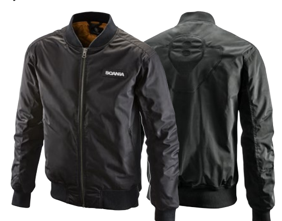
Features Padded jacket with quilted lining in contrast colour. Metal heavy zipper at front, Scania wordmark badge at chest, big V8 embroidery at back.

Quality Shellfabric: 100% polyester twill. Lining: 100% nylon.