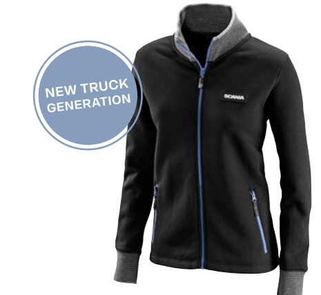
Features Classic zip sweatshirt with Scania wordmark badge on chest, contrast colour zippers in blue and two-tone structure ribs.