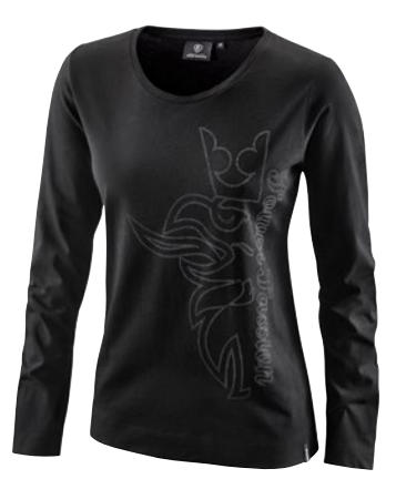
Features Regular fit long-sleeved t-shirt with cropped Griffin rubber print and Scania tab at bottom.