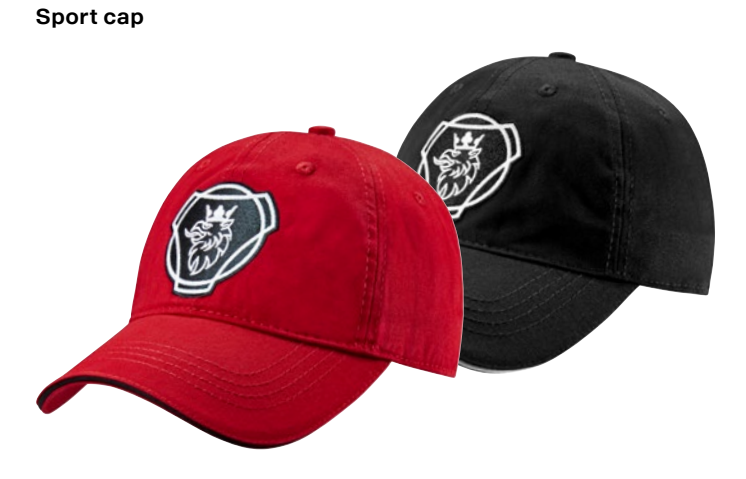
Features Scania symbol embroidery on front and Scania Truck Gear embroidery on back. Sandwich peak with contrasting colour piping and adjustable strap with metal logo buckle.