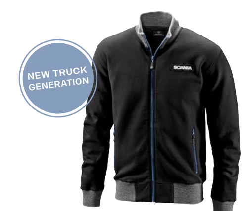
Features Classic zip sweatshirt with contrast colour zippers in blue, two-tone structure ribbing and Scania wordmark badge on chest.

Quality 100% cotton sweat, brushed inside.