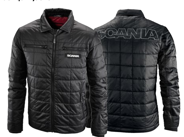
Features Classic, insulated jacket with contrasting colour lining. Large Scania symbol print on lining, Scania wordmark badge on front and Scania wordmark patch on back. Zipper with rubber symbol puller.

Quality Shellfabric: 100% nylon. Lining: 100% nylon.