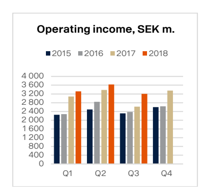
Excluding items affecting comparability (Q2 2016)